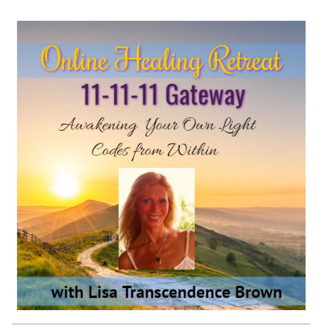
Special 11-11-11 Gateway Activation Event