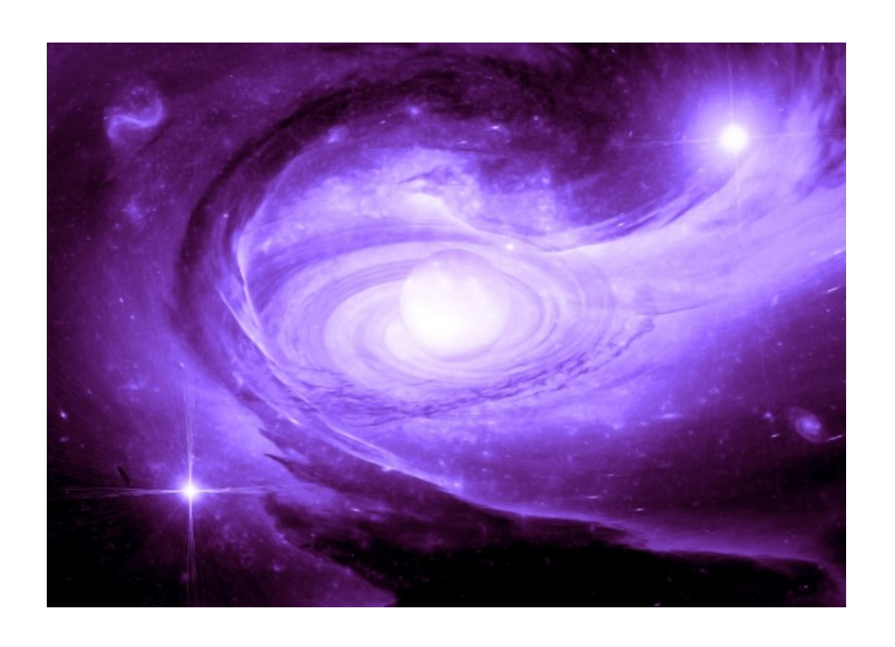
▼ TRANSCENDING ALL IDENTITIES ▼ As Your Perceptions of REALities Shift ... As YOUR Energy Shifts ... As You Let Go of the Games of Separation YOU Kept Playing Out...