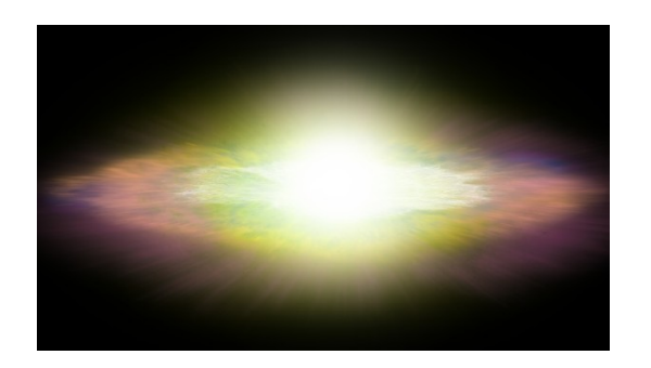
RESOLVING THE BATTLE OF THE STAR NATIONS (from within you - These codes do this for all)